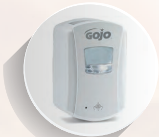
GOJO® LTX-7™ Dispenser Touch-Free Dispenser for GOJO® Foam Soap