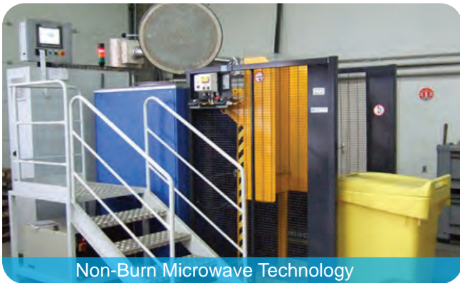
Non-Burn Microwave Technology