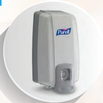
PURELL® NXT® SPACE SAVER™ Dispenser