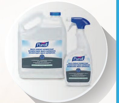
PURELL® Healthcare Surface Disinfectant