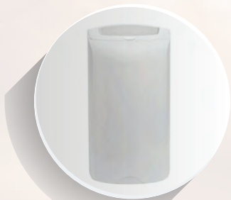
WASTECARE Paper Waste Disposal Bin