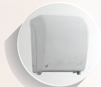
Paper Towel Dispenser