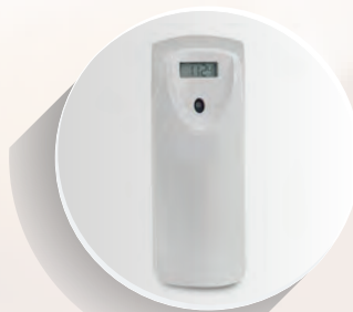
Airmist – SFX Airmist fragrance dispenser is available in 250ml and 100ml