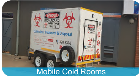
Mobile Cold Rooms