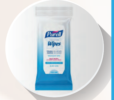
PURELL Hand Sanitizing Wipes Clean Refreshing Scent