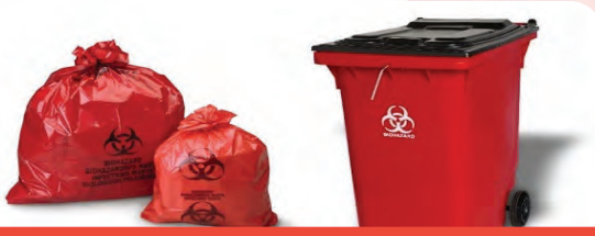
Red Bag Hazardous Waste