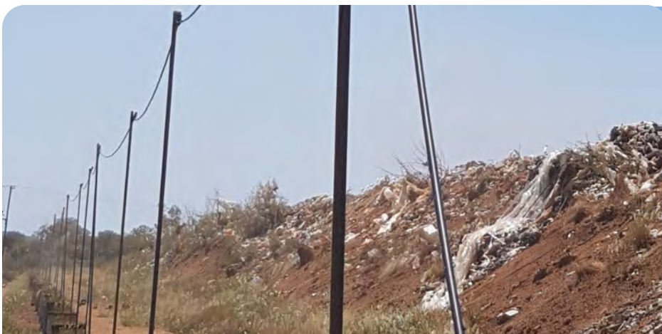
Landfill Odour Control