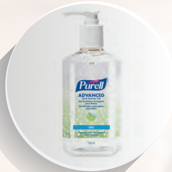
PURELL® Advanced Hand Sanitizer Gel