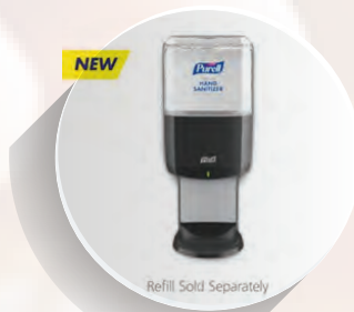
NEW PURELL® ES8 Hand Sanitizer Dispenser Touch-Free Dispenser with Energy-on-the-Refill for PURELL® Hand Sanitizer