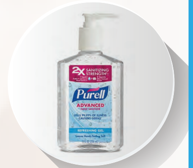
PURELL® Advanced Hand Sanitizer Refreshing Gel