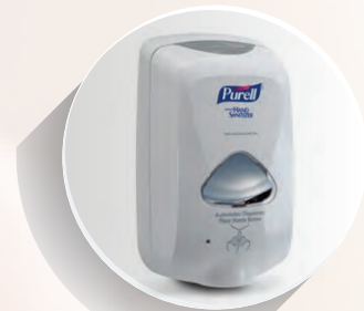
PURELL® TFX™ Dispenser Touch-Free Dispenser for PURELL® Hand Sanitizer