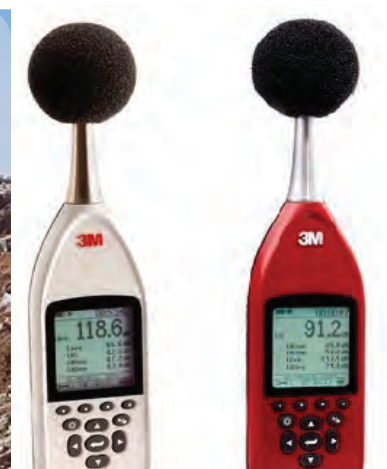
Environmental Noise Monitoring For Compliance