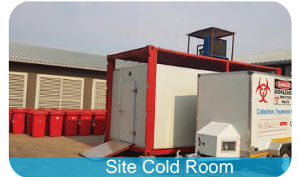
Site Cold Room