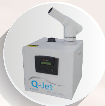
WHOLE ROOM DISINFECTION Devices and agents for surface and air disinfection by aerosols