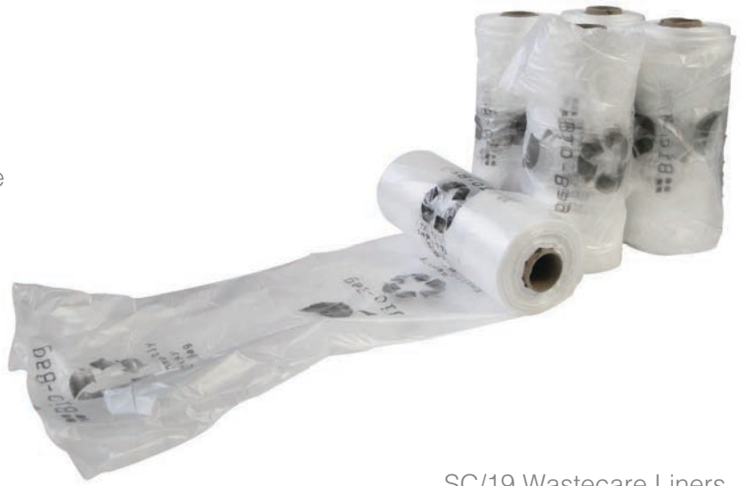
SC/19 Wastecare Liners